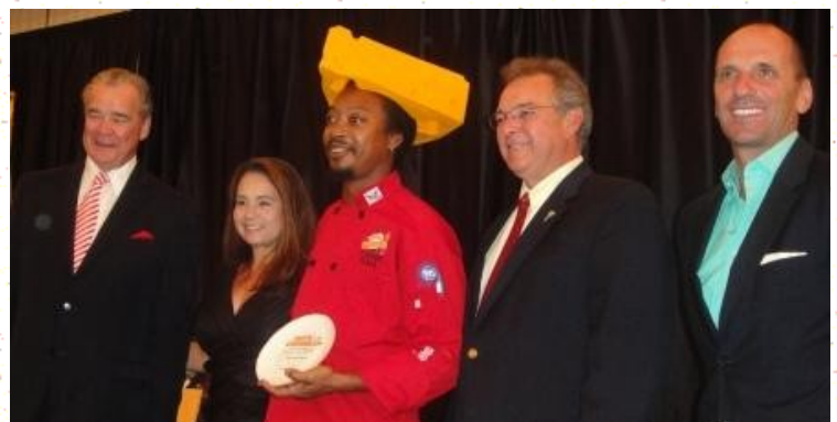
Negust Kaza—Best Use of Cheese